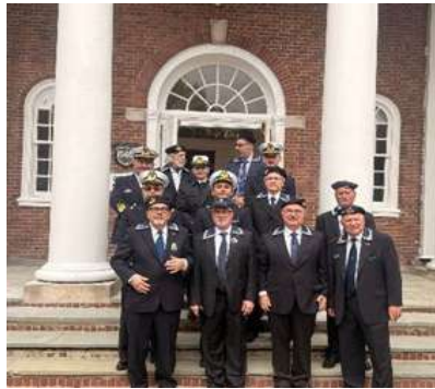
Representatives of the US Groups and active duty staff who attended the ANMI USA 2025