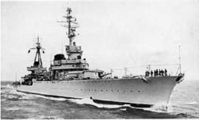
Incrociatore R. MONTECUCCOLI

The Battle of Mid-June (12-16 June 1942) saw the Italian Royal Navy achieve a clear strategic victory against the British Royal Navy, preventing the island of Malta from being resupplied.